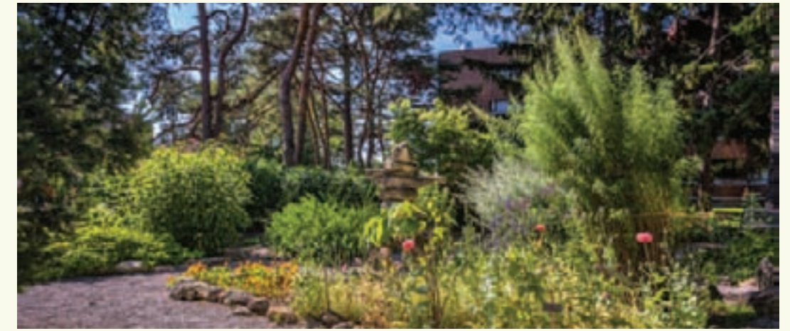
Paracelsus Herb Garden at CCNM