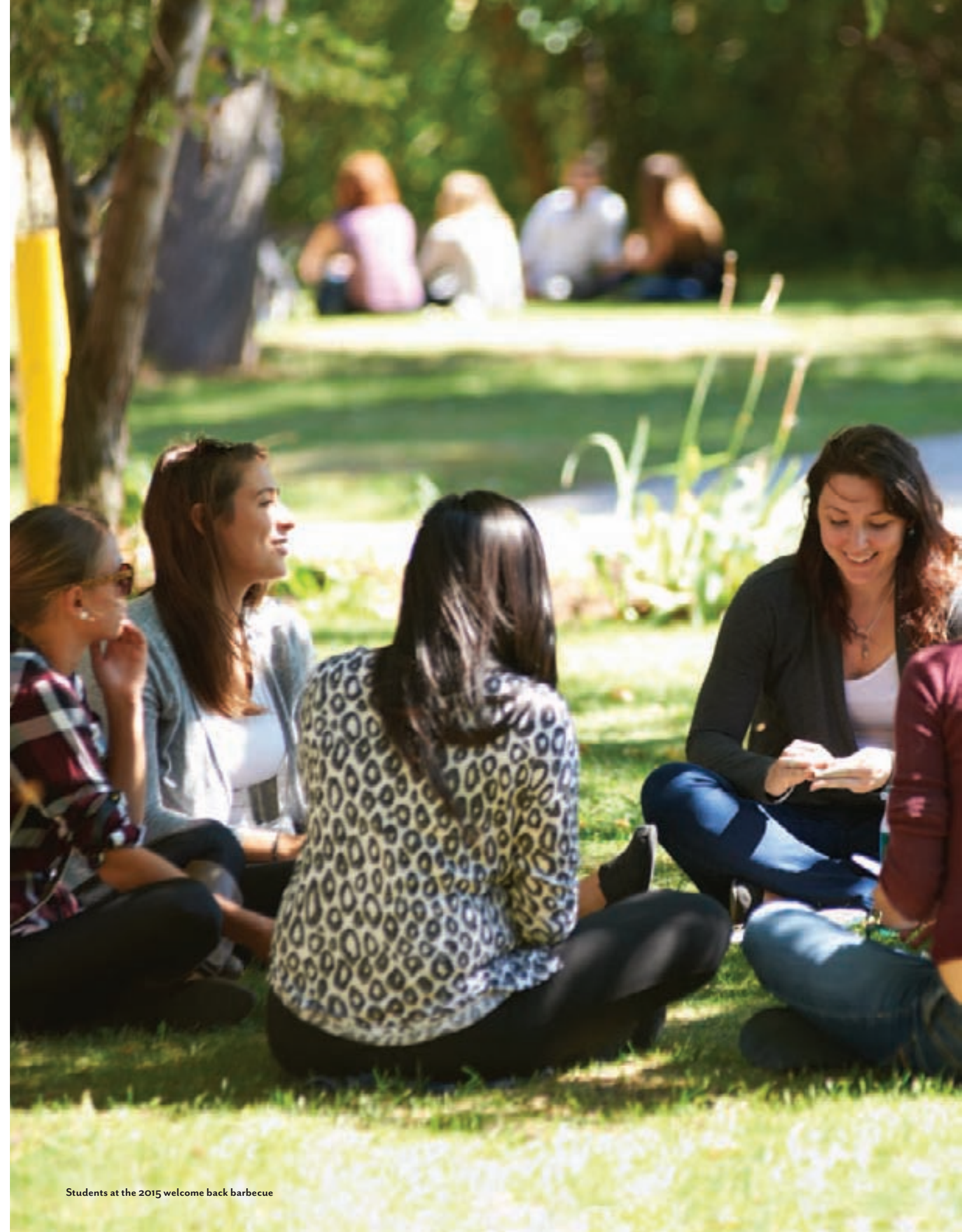
Students at the 2015 welcome back barbecue